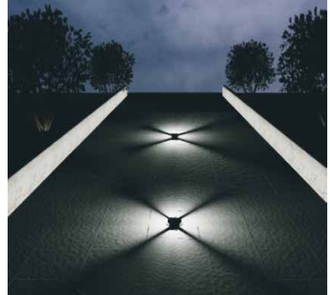
TL-GRSYL-04 4W, 12x15°