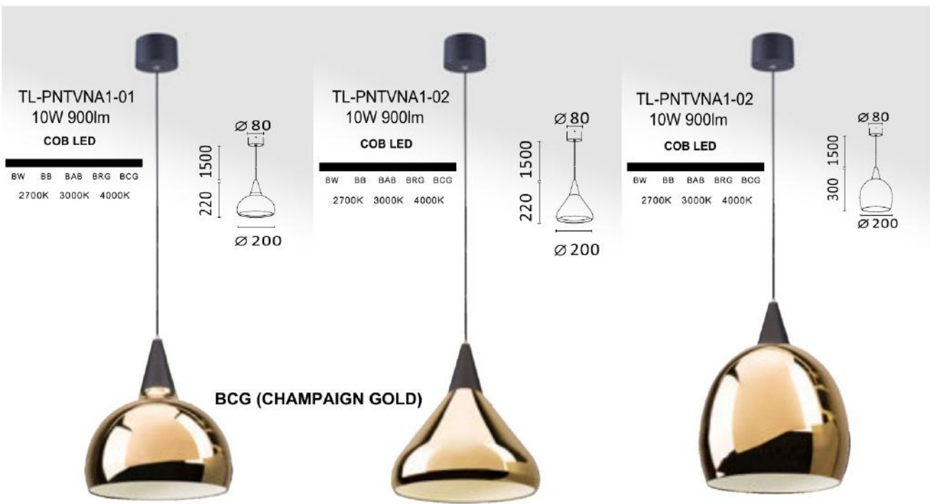
BCG (CHAMPAIGN GOLD)