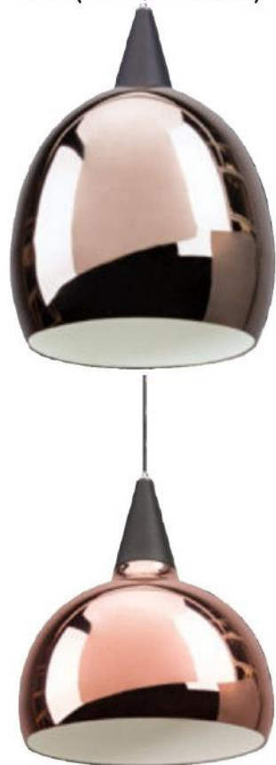
BRG (ROSE GOLD)