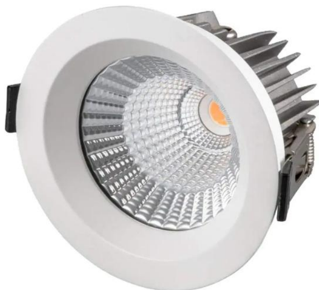
CITIZEN 20W 3000K 60°